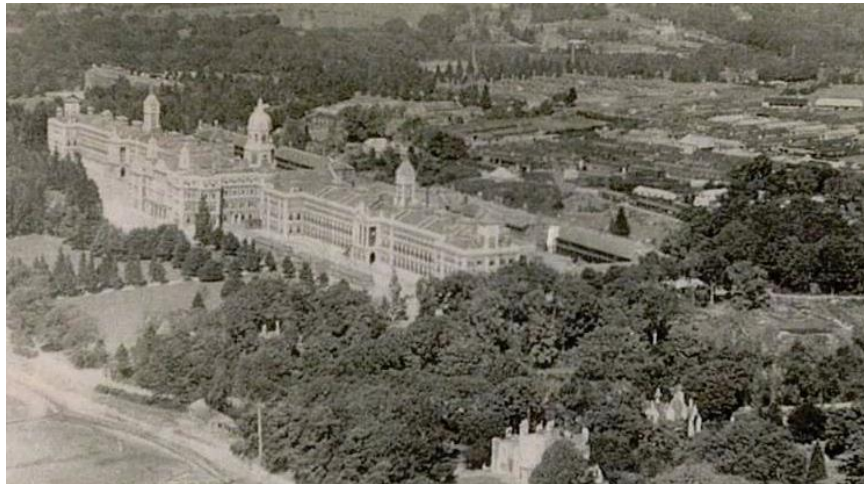
Royal Victoria Hospital, Netley